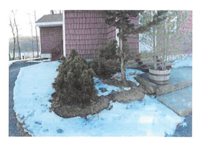
1. Current Bed, Office Side