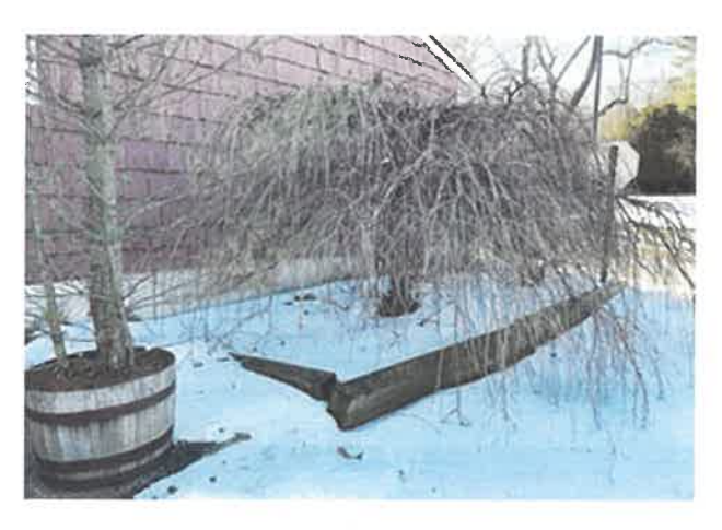
2. Current Bed, Office Side