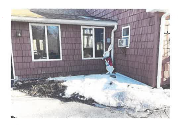
4. Site for New Bed, Office Front