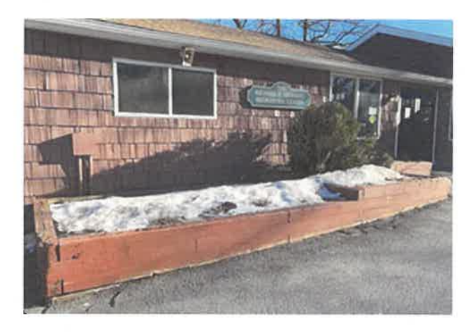
3. Current Bed, Office Front